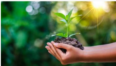
Pre-conference Thursday View the various workshops

Have a look at our conference programme and register today!