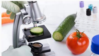
Programme Friday View the Friday programme