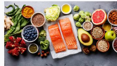
Programme Saturday View the Saturday programme